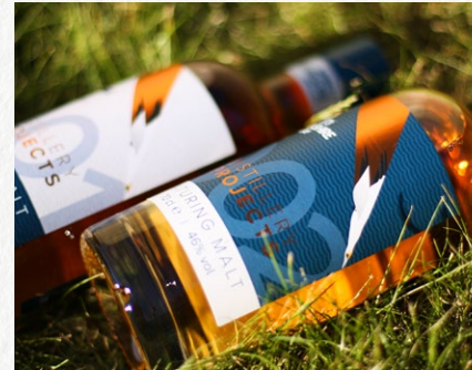
SPIRIT OF YORKSHIRE